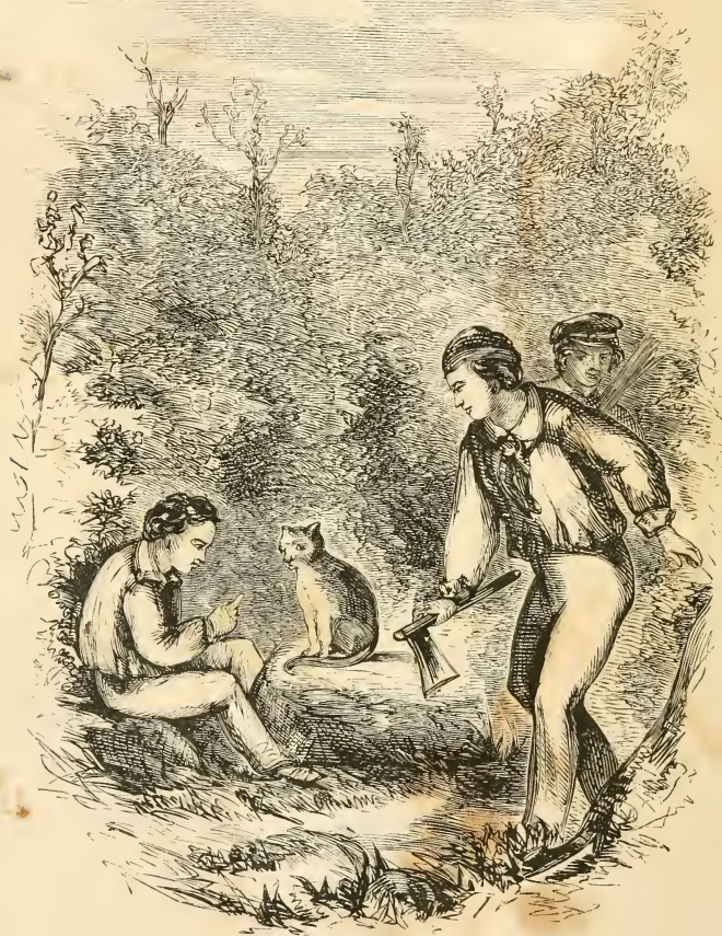
PETERKIN CAUGHT CONVERSING WITH THE CAT. Page 145